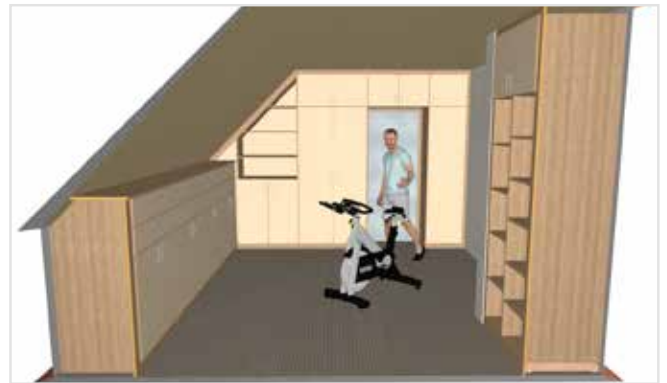
SmartWOP makes it easy to design all the furnishings for your spaces