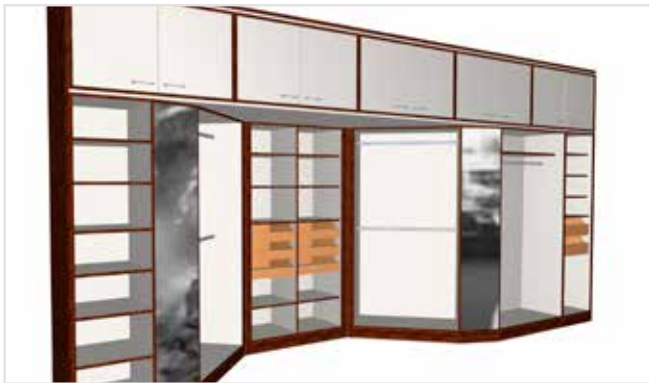
Furniture planning with defined material